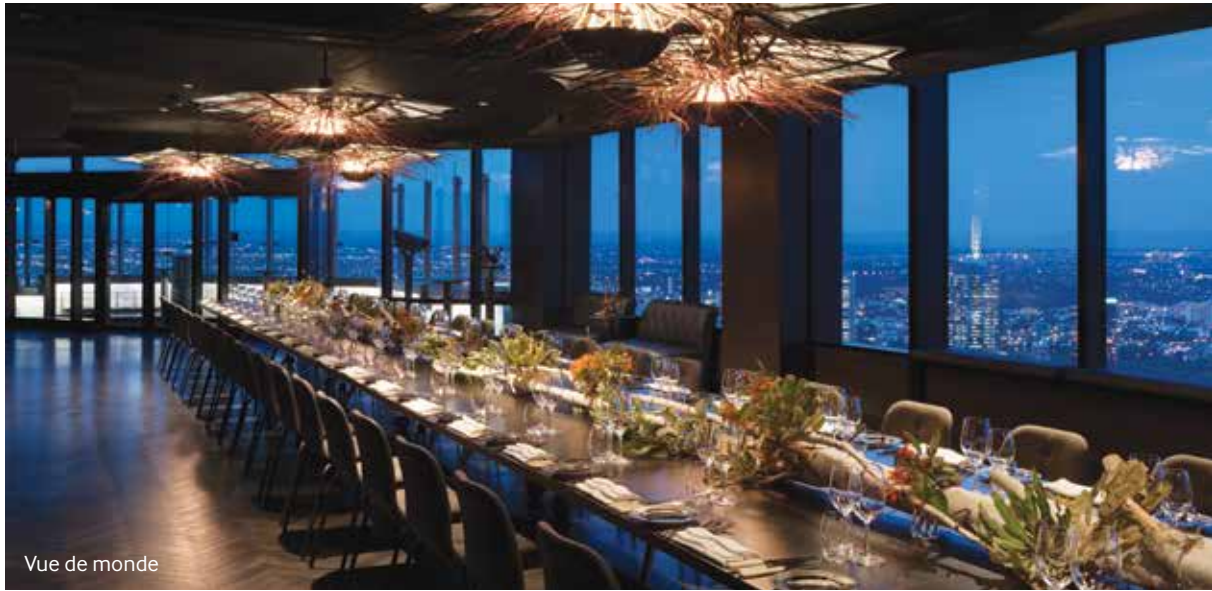
Vue de monde